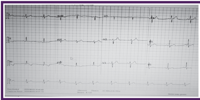
Figure.1 ECG findings of the patient at the first hospital admission